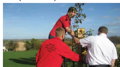
Grange Park, West Kirby

The Grange Park area of West Kirby saw environmental improvements led by the Friends of Grange Park residents' group with the planting of cherry trees and a lantern making workshop with children and young people. Tower Grounds in New Brighton saw local residents lead on an environmental audit with agencies. Work was undertaken in partnership with Leasowe Community Homes, taking the opportunity to speak with residents and young people attending the annual 'Unity in our Community' Halloween fancy dress party.